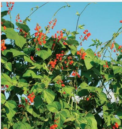
Scarlet Runner Bean

Scarlet Runner Bean: If you're looking for a vining plant, scarlet runner bean may be it! This bean produces bright red flowers, along with edible green beans.