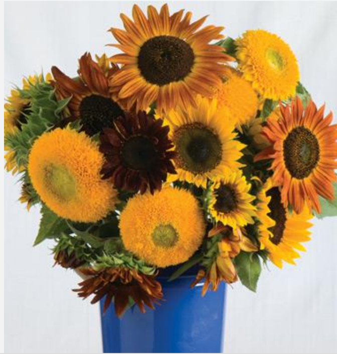
Mix of sunflower varieties

Sunflowers: This flower type offers plenty of interesting varieties. Colors range from the traditional gold to pale yellow, pinkish, burgundy, and chocolate. Plant height can range from a couple of feet to towering above any other garden plant! And the blooms can be tiny and numerous to giant and one per stalk. Have fun choosing!