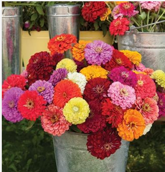
Mix of zinnias

Zinnias: A traditional cutting flower, zinnias come in a huge variety of bright colors. Choose from reds, yellows and oranges, or purple, pink...even lime green!