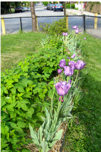
TULIPS BLOOM BESIDE RASPBERRY PLANTS

Otherwise known as ornamental onion, these flowers are typically white, purple, or pink. The “flower” is actually a cluster of tiny blossoms in a circle or oval shape, atop a long straight stem. Choose from varieties anywhere from a few inches to a few feet tall! Plant these deer resistant bulbs based on their size: large bulbs 6" deep, 12-18" apart, small bulbs 3-5" deep, 6-8" apart.