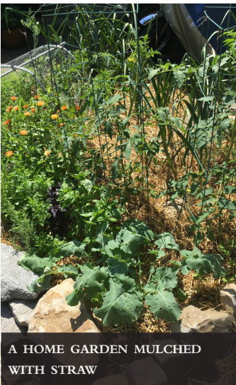
A HOME GARDEN MULCHED WITH STRAW