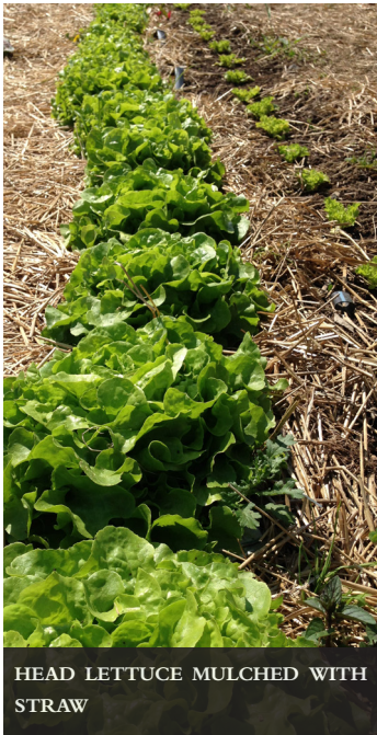
HEAD LETTUCE MULCHED WITH STRAW