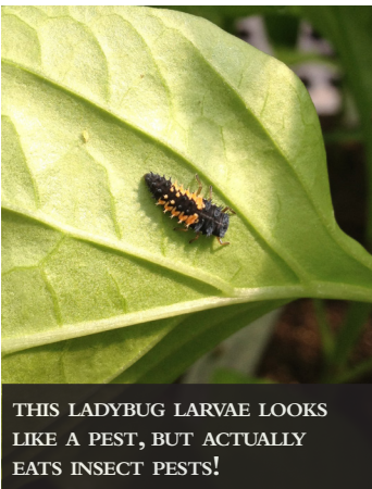
THIS LADYBUG LARVAE LOOKS LIKE A PEST, BUT ACTUALLY EATS INSECT PESTS!