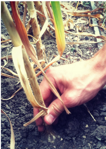
TESTING THE SOIL TO SEE HOW LOOSE IT IS