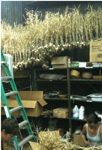
CURING BRADDOCK FARMS' GARLIC HARVEST

Well-cured garlic should last for many months, and can also be used for seed garlic in the fall.