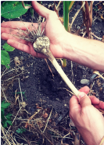
HARVESTED GARLIC, READY TO CURE