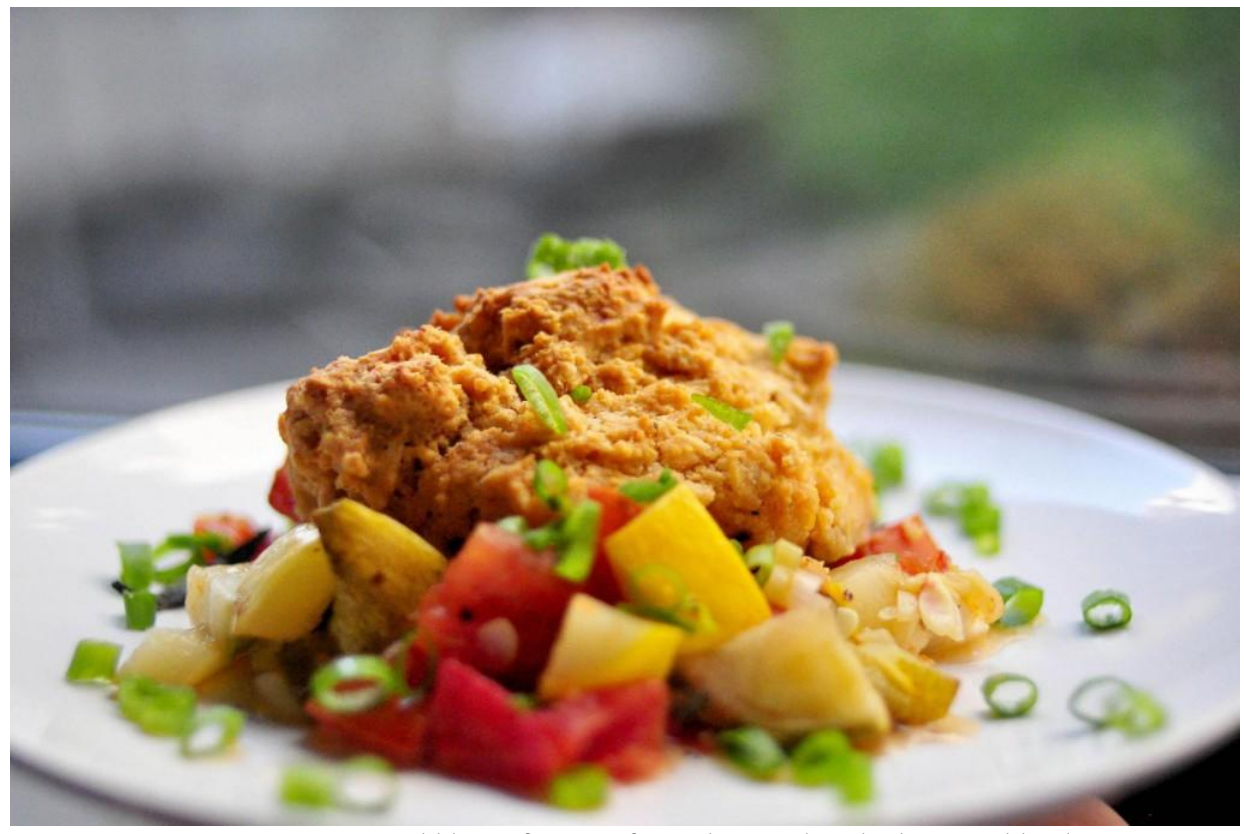
Savory Summer Cobbler, a favorite from the Good and Cheap cookbook.

The cookbook is beautiful and fun, and includes lots of recipes from main dishes (like Savory Summer Cobbler and Vegetable Quiche, Hold the Crust) to desserts (Fast Melon Sorbet), snacks (Cornmeal Crusted Veggies), breakfasts, salads, handheld foods, drinks, and sauces.