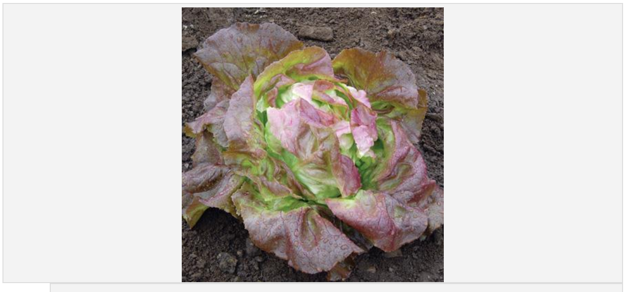
Skyphos butterhead lettuce from Johnny's Seeds isan example of a heat resistant variety.

Lettuce is a cool season crop and does best in the spring and fall. In the heat, it often fails to germinate, or gets bitter and "bolts" (grows a long stalk and seed head). But, if you're absolutely set on growing some for summer salads, here are some suggestions to help.