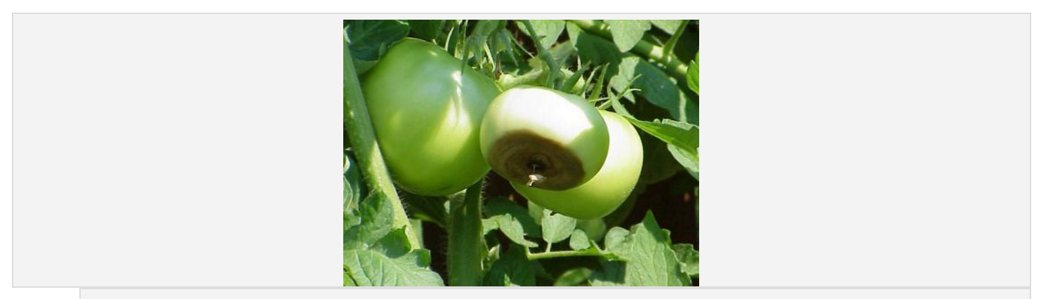
Blossom end rot evident on a green tomato fruit.

Blossom end rot occurs when the plants' fruits are forming. Due to environmental conditions like too little, too much, or widely fluctuating amounts of water available, the plant is unable to access the required Calcium that it needs to form cell walls. Calcium is available to plants in a dissolved form, in water that reaches the roots. If there is too little water or if the roots are overly saturated with water, they can't absorb enough Calcium. Without that essential, cell-forming nutrient, the tissue on the blossom end of the fruit breaks down.