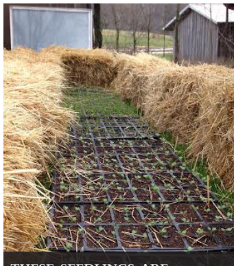
THESE SEEDLINGS ARE PROTECTED BY INSULATING STRAW BALES - WINDOWS ARE PLACED OVER THE SEEDLINGS AT NIGHT AND FABRIC ROW COVER IS USED ON DAYS OF FULL SUN