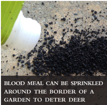
BLOOD MEAL CAN BE SPRINKLED AROUND THE BORDER OF A GARDEN TO DETER DEER