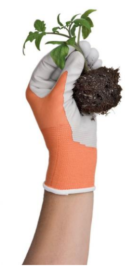
From Gardeners Supply.

Nitrile gloves : These colorful gloves fit like a second skin, offering a tough layer of protection. They are thin enough that they work for most tasks – even ones requiring precision.