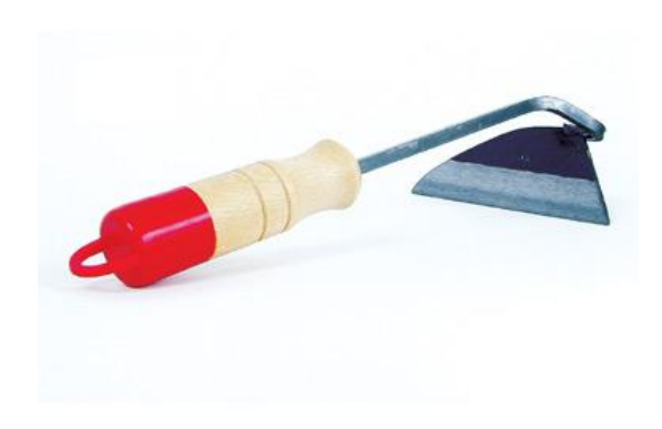
A hand hoe from Johnny's Selected Seeds.

Unique hand tools : Hand tools can be pricey – especially good quality ones. But they are essential to gardening, and can make tasks easier, if not enjoyable! We recommend Rogue hand hoes or the one pictured below.