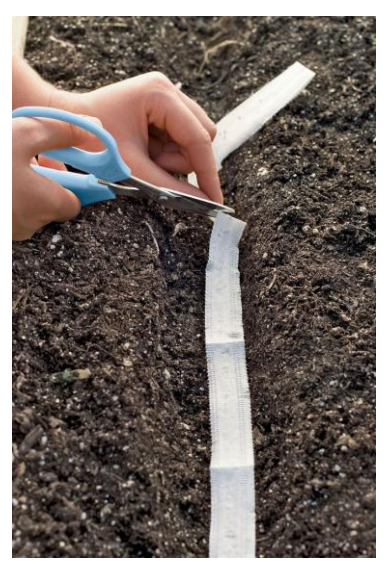
This seed tape is from Gardeners Supply. Another great supplier is Territorial Seeds.

Seed tape : Seed tape takes the question marks out of planting. Just dig a trench the proper depth for the seed, unroll the biodegradable tape, and cover with soil. The seeds will germinate at the correct spacing!